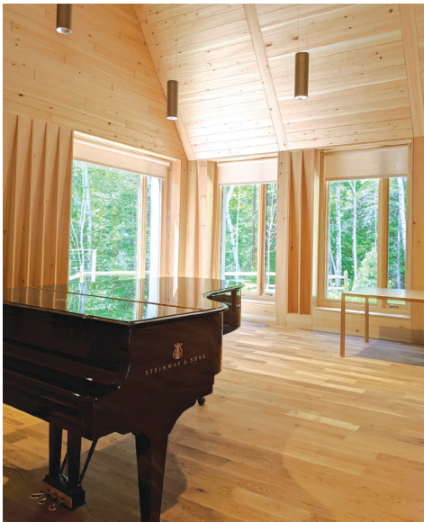
From top: the Jerome & Celia Bertin Reich Building; new dormitory; the Alexander Schneider Rehearsal Room.