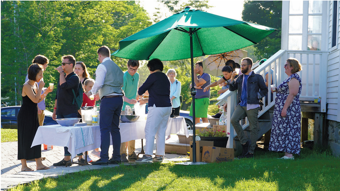
Marlboro family gathers outside the Dining Hall