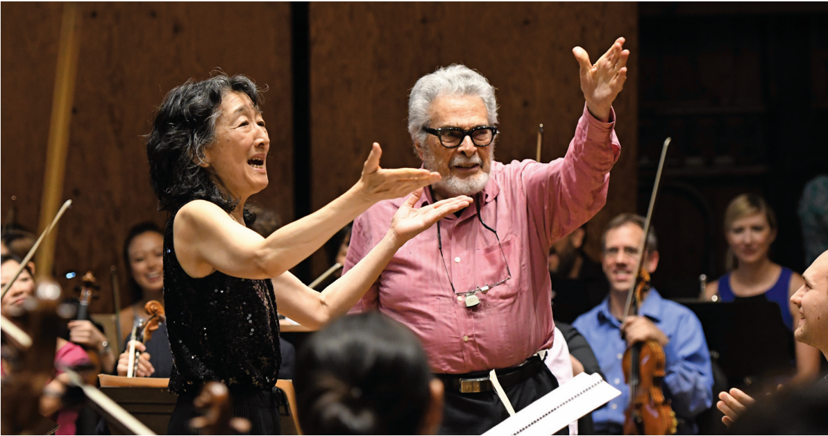
Mitsuko Uchida and Leon Fleisher

We celebrate the life of Leon Fleisher, one of the most revered pianists of the last century. Leon was a vital member of the Marlboro family, an incredible musical resource, and an artist whose warmth and generosity of spirit made him beloved by his colleagues and our young participants alike.