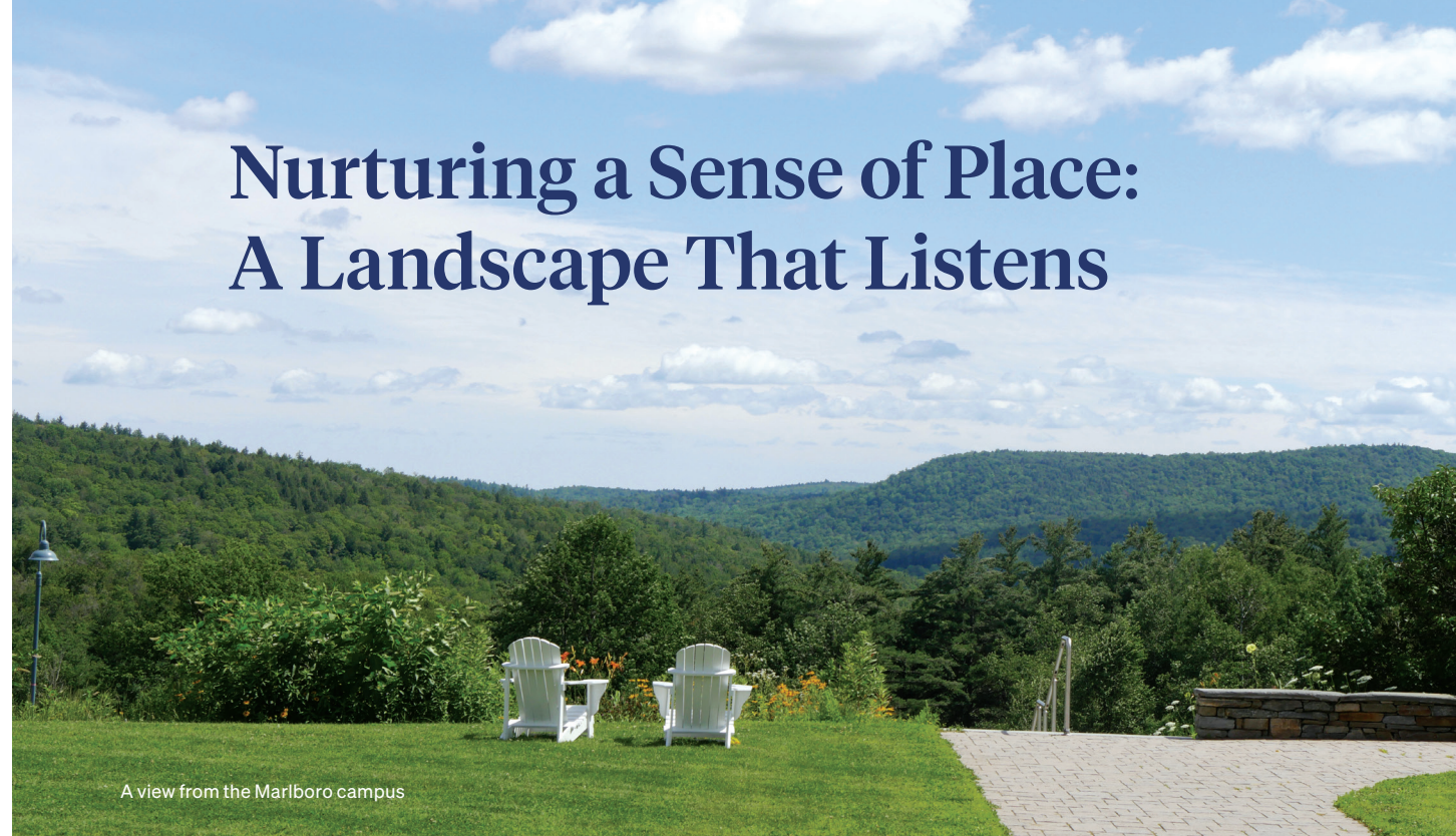
A view from the Marlboro campus

Nestled on 560 acres in the hills of southern Vermont, Marlboro's campus is more than a backdrop—it is an essential partner in the creative process. Historic farm buildings, winding trails, open fields, and quiet gathering spaces create an environment that encourages focus, reflection, and connection with the natural world.