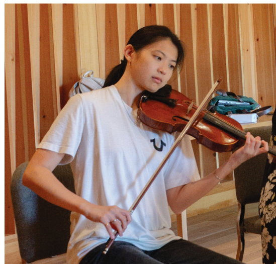
Violinist Tiffany Chang