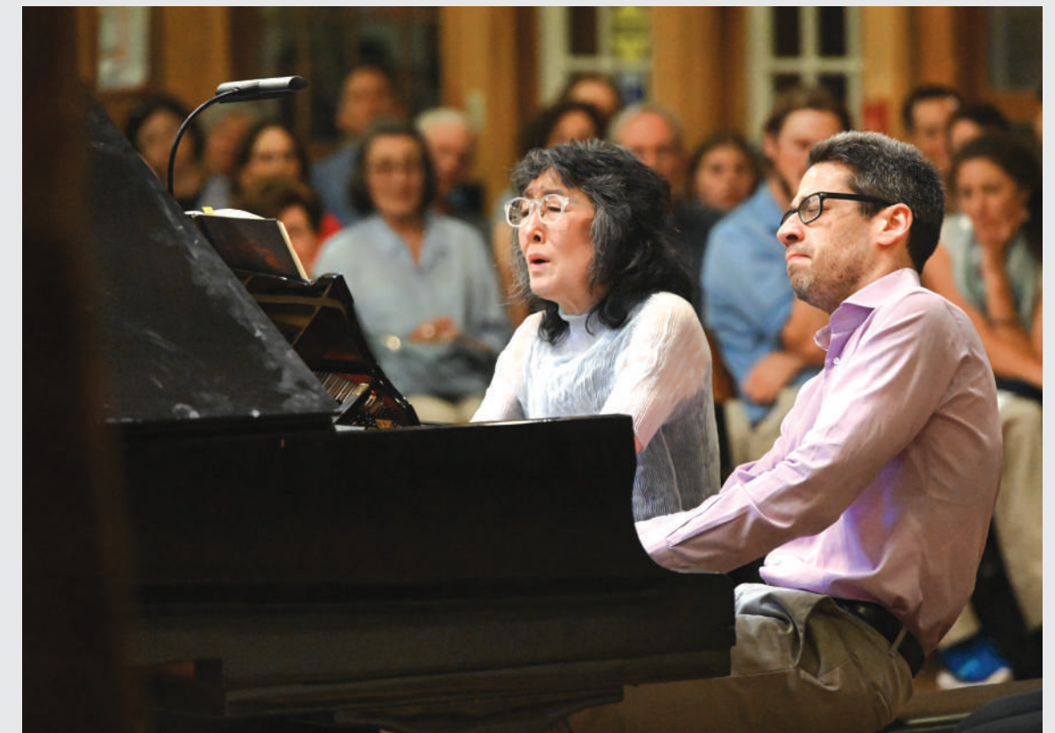
Mitsuko Uchida and Jonathan Biss.